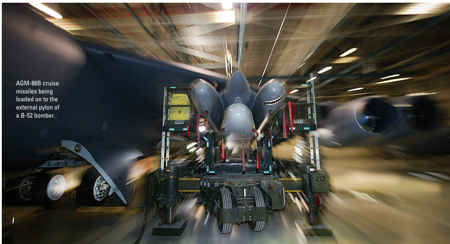
AGM-86B cruise missiles being loaded on to the external pylon of a B-52 bomber.

The insight into the capabilities of the Soviet air defense network lasted until 1985, when Tolkachev was caught by the Soviets, charged with espionage and executed. Reagan's decision to resume the B-1 bomber program raises questions that are perhaps best explained by his predecessor. In his 2010 book White House Diary , Jimmy Carter wrote: "Under pressure from lobbyists and the defense establishment,