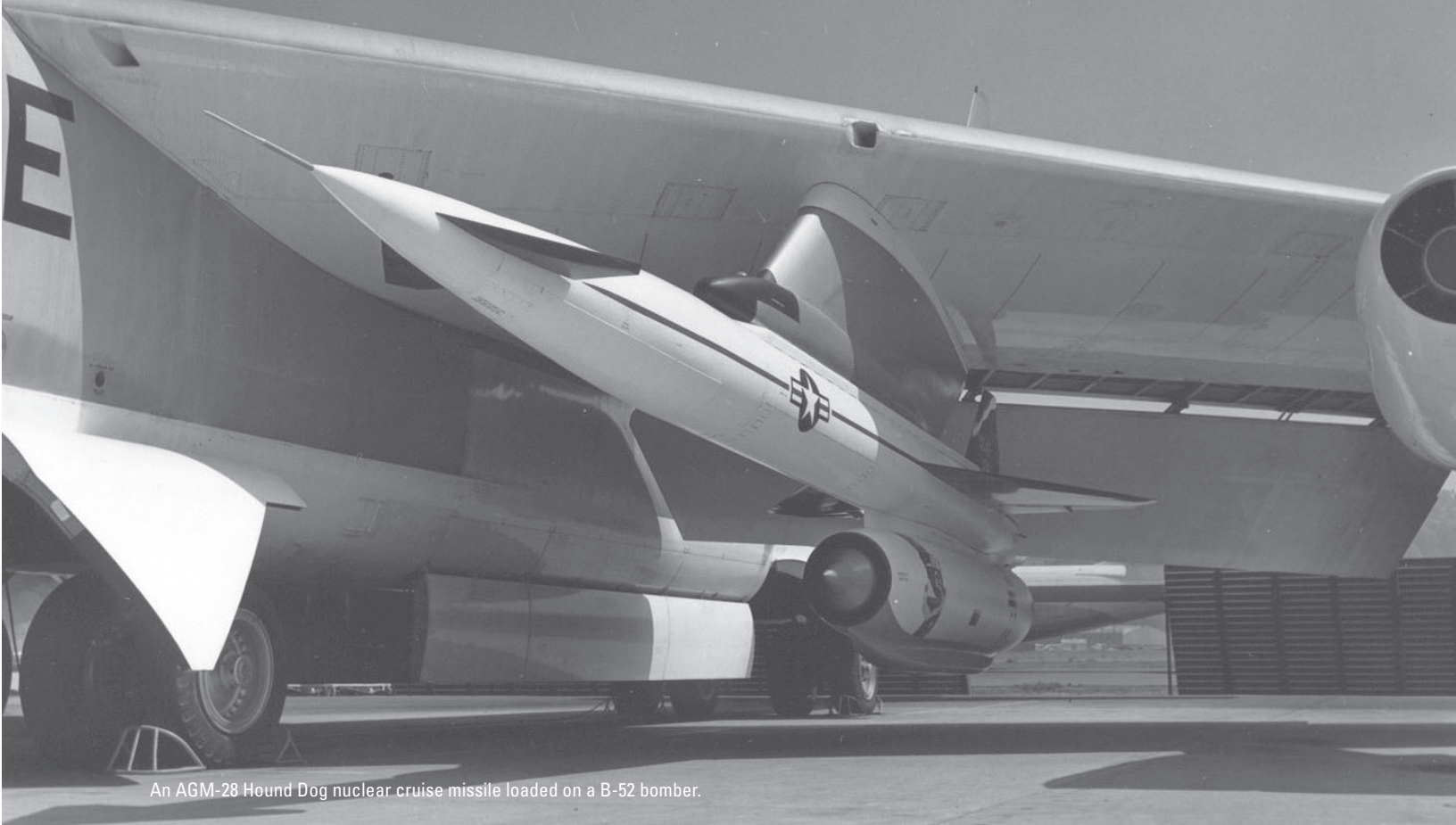
An AGM-28 Hound Dog nuclear cruise missile loaded on a B-52 bomber.