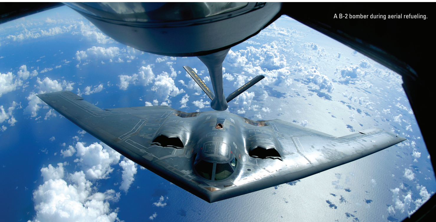
A B-2 bomber during aerial refueling.

decisions about response options can be made and implemented in a postattack environment.” 46