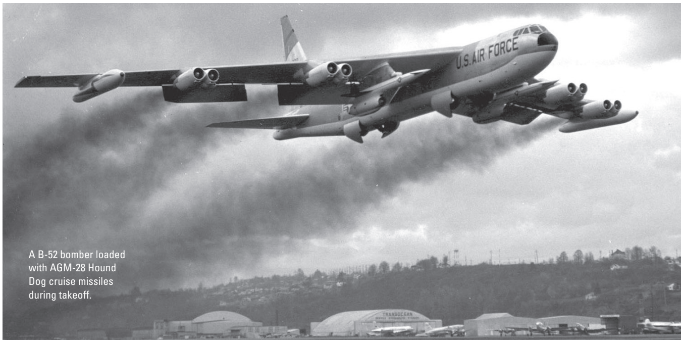
A B-52 bomber loaded with AGM-28 Hound Dog cruise missiles during takeoff.

The 1950s and 1960s also saw a series of changes that challenged the B-52's role in the nuclear arsenal. With the development of nuclear-armed submarines and intercontinental ballistic missiles (ICBMs), the B-52 was no longer America's sole means of threatening strategic targets with nuclear weapons. This new "triad" of delivery systems, a reference to the three legs of the nuclear arsenal, meant that America could hedge against failures in a given weapons system. In the unlikely event that one of the legs of the triad should fail, or if an adversary developed defensive