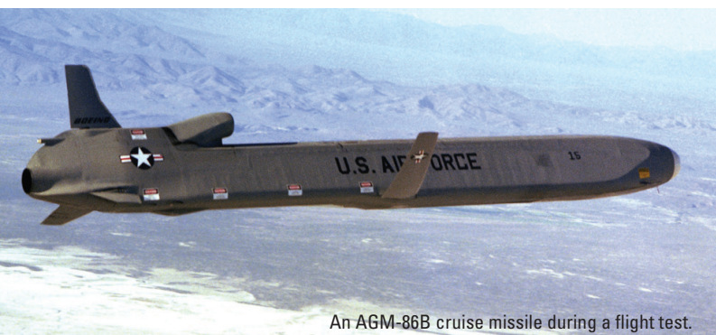
An AGM-86B cruise missile during a flight test.

dollars). But at the same time that the DoD is supposed to be reducing its spending, it planned extensive replacement programs for all three legs of the triad, as well as upgrades to conventional forces. All of these programs will reach their spending peaks at roughly the same time in the mid 2020s, creating a spike in spending that experts commonly refer to as a “bow-wave.” This bow-wave will exceed the caps that Congress has established for defense spending, bringing the DoD’s plans in direct conflict with current legislation. 49