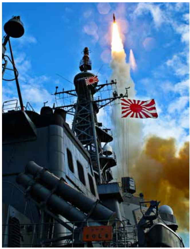
Joint U.S.-Japanese test of the SM-3 missile in 2010.

tubes are loaded by offensive interceptors."<sup>115</sup> Another interviewee said that verifying what really is in the launch tubes would require Russian presence at the sites, which seems unlikely in the current political circumstances.<sup>116</sup>