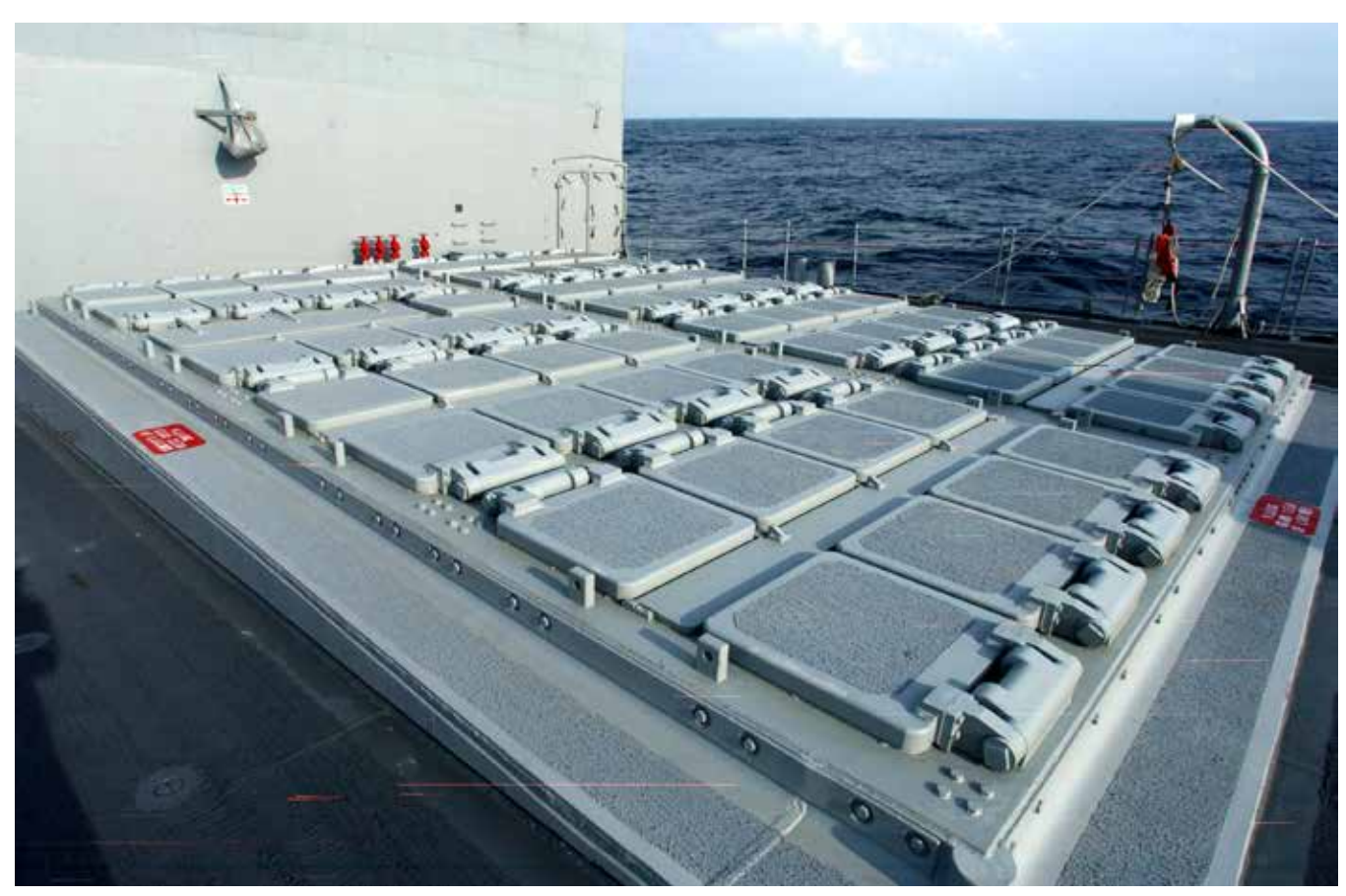
The multi-purpose launch tubes of the MK-41 Vertical Launching System (VLS).