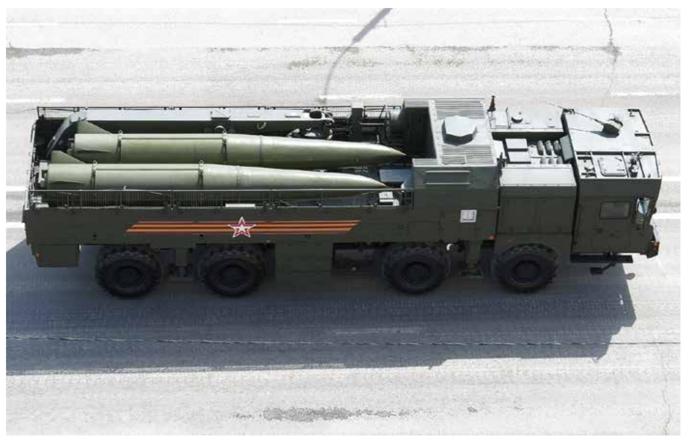
Iskander-M short-range missile was designed to penetrate air and missile defense systems.