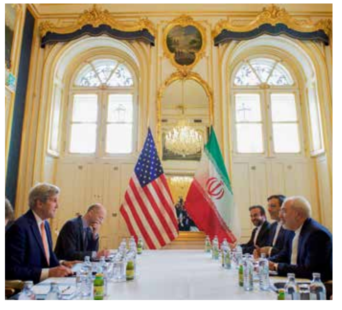
U.S. Secretary of State John Kerry and Iranian Foreign Minister Javad Zarif discussing the nuclear deal in Vienna, May 17, 2016.

International suspicions about the potential military dimensions of Iran's nuclear program emerged in the early 2000s with revelations of undeclared uranium enrichment-related activities in the country. This led to a protracted crisis involving a series of international sanctions against Iran. However, concerns about Iran's nuclear program were significantly reduced by the July 2015 nuclear deal, the Joint Comprehensive Plan of Action (JCPOA). The deal allows for limited uranium enrichment in Iran in return for exceptionally intrusive inspections and strict limits on