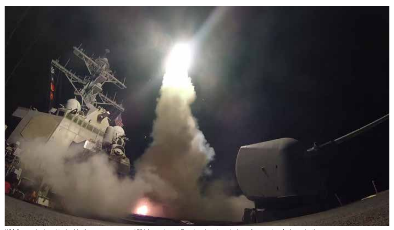
USS Porter, deployed in the Mediterranean as part of EPAA, conducted Tomahawk cruise missile strikes against Syria on April 7, 2017.