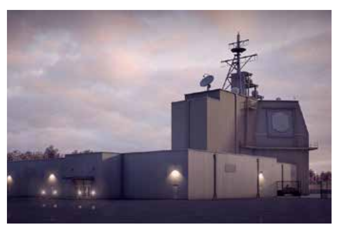
Aegis Ashore missile defense site in Deveselu, Romania.

This complexity discourages any open debate on NATO missile defense, which is now running on autopilot. As the SWP experts note, "NATO's insistence on pushing ahead with a missile defence system does not necessarily imply agreement over its purpose and goal. The lack of a debate can be explained by Washington's sustained willingness to fund the programme almost entirely itself. For many, the political costs of changing course also appear higher than those of continuing the programme." Such political costs have been raised by the conflict with Russia, as allies are inclined to avoid any sign of weakness vis-à-vis Moscow.